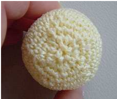
Image 02 - Bottom